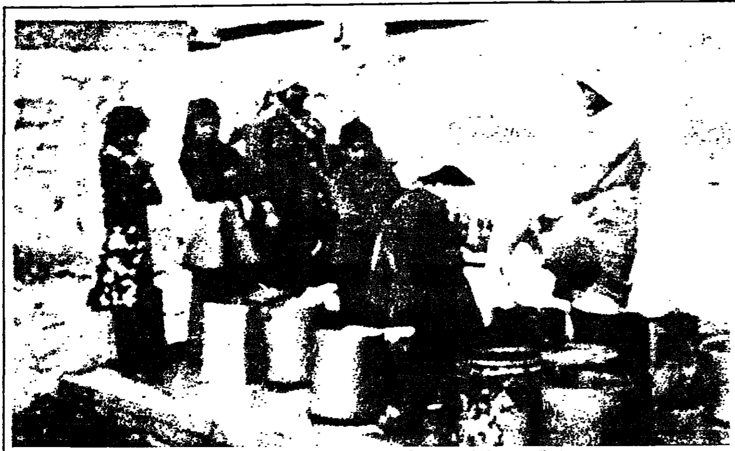
You cannot 'cheat' the viewers with the 'wrong props,' according to Saud Al Fayyad. We insist on 'reality.'